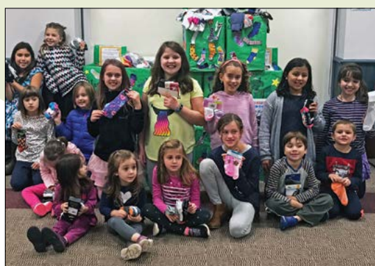
'Socktober' with the Glastonbury Newcomers and Neighbors Club