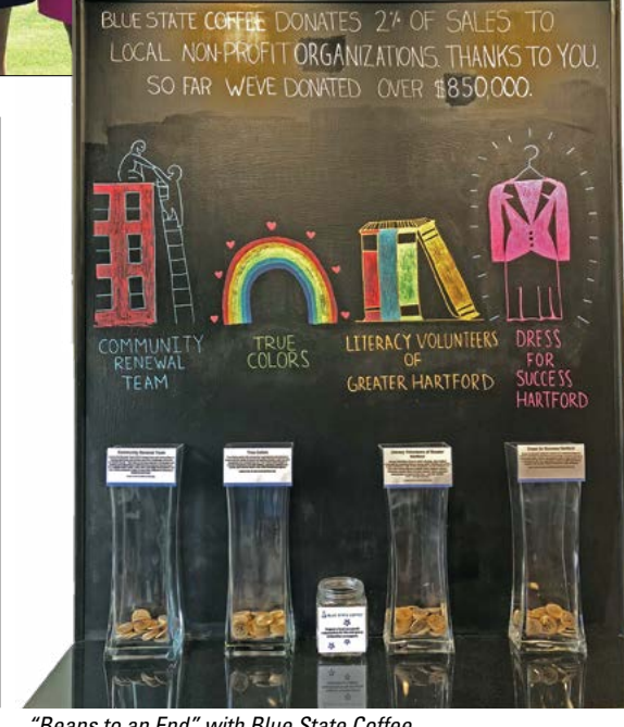
"Beans to an End" with Blue State Coffee