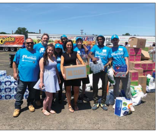
8th Annual 'Helping Feed Hartford'