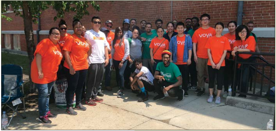
Voya Volunteer Day