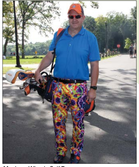
Meals on Wheels Golf Tournament

Thank you to all the volunteers from VOYA who joined us during their National Day of Service at five different CRT sites, including CRT Generations in Hartford, along with the team from Capital City YouthBuild to help us plant an amazing veggie garden for the residents. There was a bumper crop by the end of the summer!