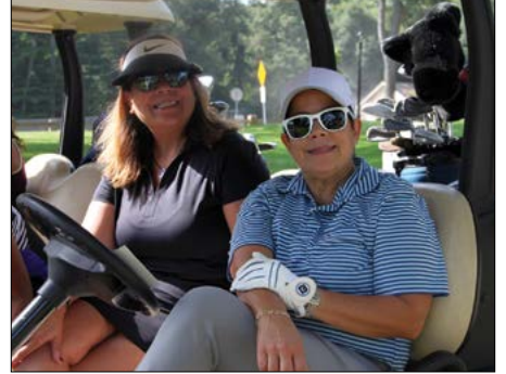
Meals on Wheels Golf Tournament