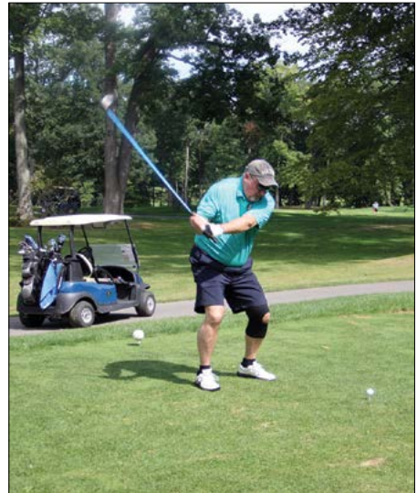
Meals on Wheels Golf Tournament