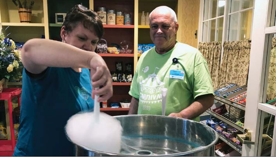
The Retreat Summer Carnival