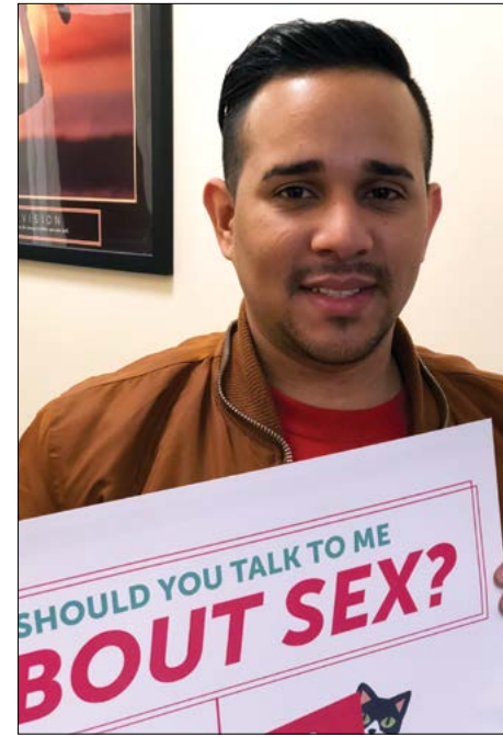
Free HIV Testing on Valentine's Day