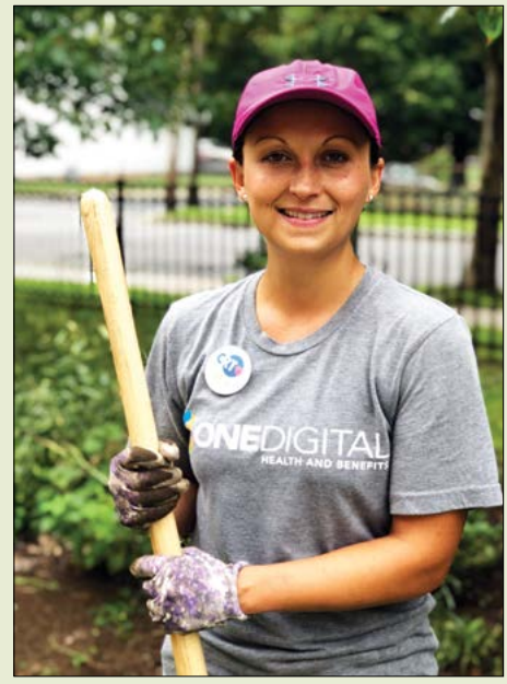
OneDigital Volunteer Day

On Thursday, September 13, more than 35 volunteers from OneDigital, United Healthcare and Harvard Pilgrim Health spent several hours volunteering to help out at CRT programs throughout Hartford. Some volunteers worked outside doing fall cleanup projects while others spent time indoors organizing the shelves of food pantries and supply closets.