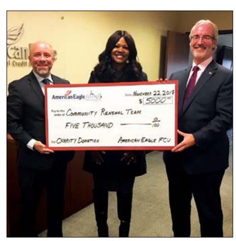
Support for Veterans

American Eagle Financial Credit Union makes an annual donation in support of CRT's Veterans Services! In November of 2017, they presented CRT with a check for $5,000.