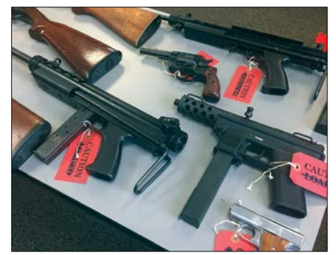
9th Annual Gun Buyback Event