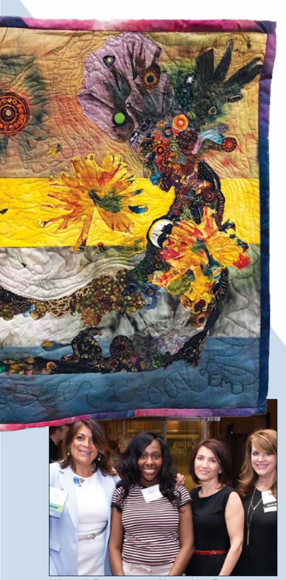
Women's Empowerment Networking Event