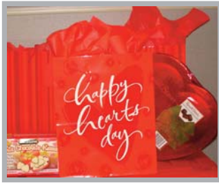
Valentine gift bags provided for all 21 women in the Fresh Start Program

In celebration of Valentine's Day, women from the Hartford area and CRT's Planning Department shared a little love by reaching out to the women at CRT's Fresh Start Program. Twenty-one gift bags filled with Valentine chocolates, shower gels, lotions and a variety of other items were delivered